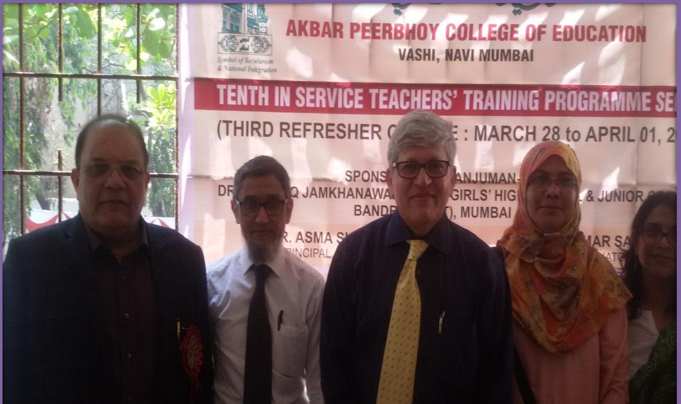
Tenth In Service Teachers Training Programme A-I's Dr. M.I.J Girls High School March to April. 28-01, 2016