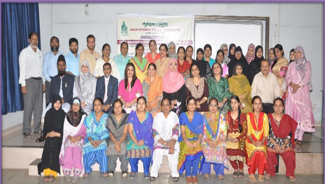
Tenth In Service Teachers Training Programme A-I's Allana English High School C.S.T, Oct. 26-30, 2015

Three Refresher Courses have been organized, First at A. I's Allana C.S.T, Second at A.I's A.P.C.E, Third at A. I's Bandra Girls School.