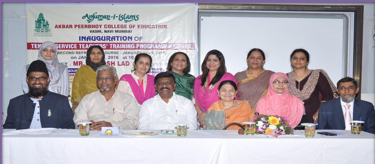
Tenth In Service Teachers Training Programme A-I's Akbar Peerbhoy College of Education, Vashi Jan. 05-09, 2016