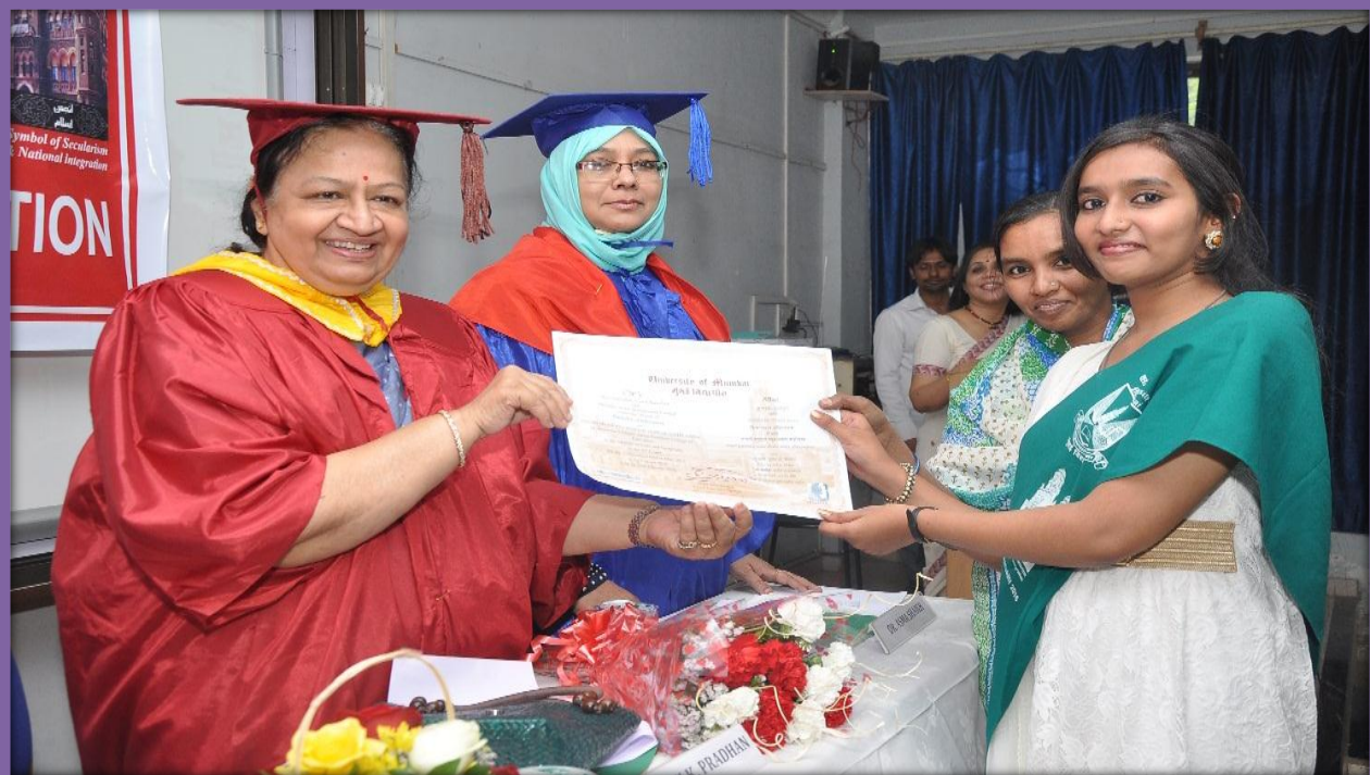
Annual Degree Conferment Ceremony: 23 Jan 2016.