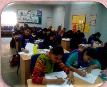
Marathi Diwas Celebration