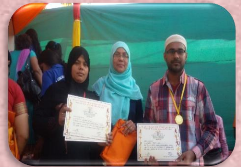
Winners of District Level Sports