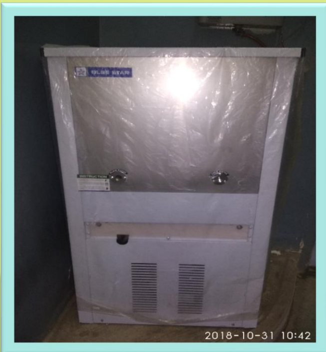
Water Cooler Donated from HPCL